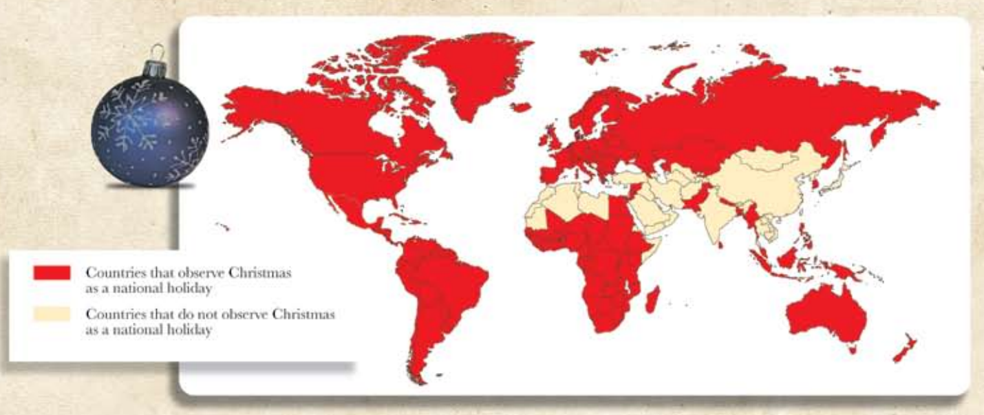
1.11 Countries where Christmas is celebrated as a national holiday

The celebration of Christmas is an example of a traditional culture trait that is still widely observed.