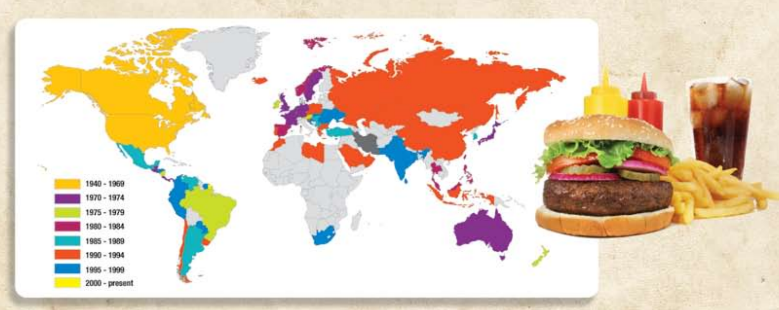
1.8 Countries in which McDonald's restaurants are located. What category of culture does this represent?

1.7 Provinces/states in which Tim Hortons stores are located. This map illustrates the culture region where Tim Hortons franchises are located. What category of culture does this represent? Are you wondering about the Tim Hortons located smack in the middle of Asia? It's operating out of the Canadian military base in Kandahar, Afghanistan.